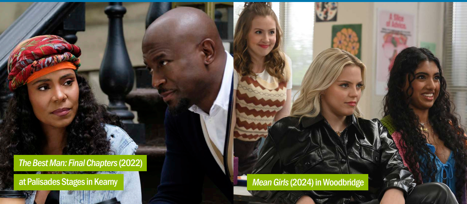
The Best Man: Final Chapters (2022)

Discover why New Jersey is a world-class location for film and television production.