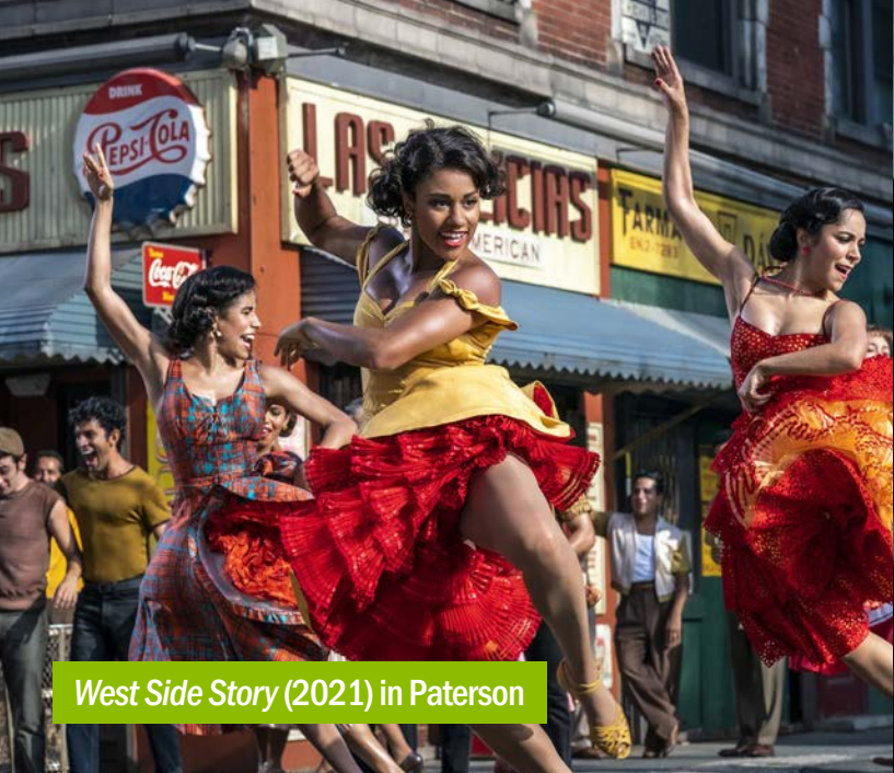
West Side Story (2021) in Paterson