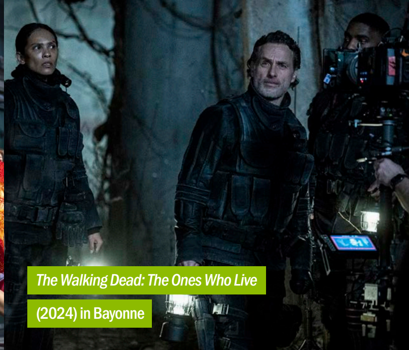
The Walking Dead: The Ones Who Live